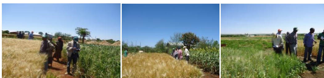
Figure 3: Candidate food Barley varieties visited by NVRC at different kebeles of Fedis district

The NVRC appointed a sub-committee by invitation of Fedis Agricultural Research Center composed of a national variety releasing committee (NVRC) members and other specialists to report on variety performance after examining the data and field visits. The report covered performance data evaluation, field performance evaluation and recommendations for the NVRC. Accordingly, In 2012 NVRC consisting of three researchers; one breeder, one agronomist and one pathologist were come to Fedis and were able to observe the varieties planted at four locations at Fedis district (Figure 3). As a result, the committee has collected different data with their respective profession and appreciated the varieties performance with the prevailing hot weather in the area.