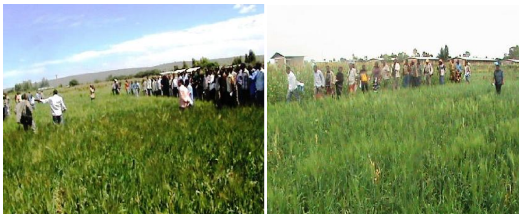
Figure 2: Farmers' field day for Evaluation of the Barley varieties planted at different kebeles in Fedis district

paper) broadcasted the varieties performance to rural communities in the country as a result of which great demand for the varieties was created.